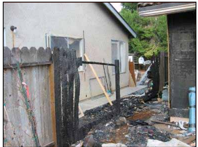
Create non-combustible space between the wood fence and the house walls with metal gates, and similar material.