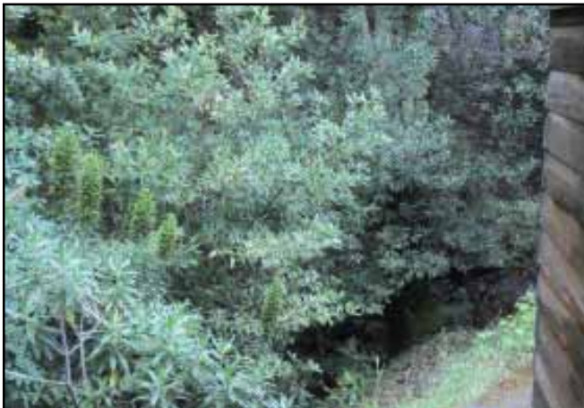
Defensible space: before ...