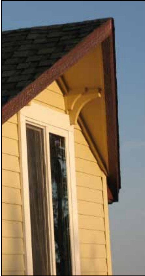
Existing homes can and should be made fire resistant too.

Approved building products for the WUI are listed by the Office of the State Fire Marshal on their web site at http://osfm.fire.ca.gov/licensing-listings/licenseListing_bml_search-cotest.php