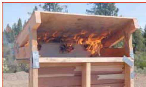
Debris on the outside can lead to flames on the inside!

Upgrading to a Class A roof should be the first priority for anyone with a wood shake or old, deteriorated roof covering. However, because the roof and siding are dominant features on houses, many homeowners get a false sense of security when they install Class A roofs and siding. Each year, many of the homes are lost in wildfires that had Class A roofing and non-combustible siding. This clearly illustrates that some less obvious fire-protection elements are also quite important.