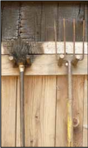
Though it charred the siding, luckily, the broom didn't fully ignite this building.

Surprisingly often, it's the little things around the house that ignite to spread flames to the building.