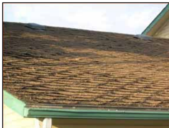
Though it may have originally had a Class A rating, this old, weathered asphalt composition shingle roof would no longer provide adequate protection against embers and heat.

Laws passed in the 1990s required fire rated Class A materials (such as asphalt composition shingles and concrete tile) on all new homes and roof replacements in high fire hazard severity zones. Although fire rated roofs are now the norm, there are still many older homes that do not have Class A roofs. Notably, non-