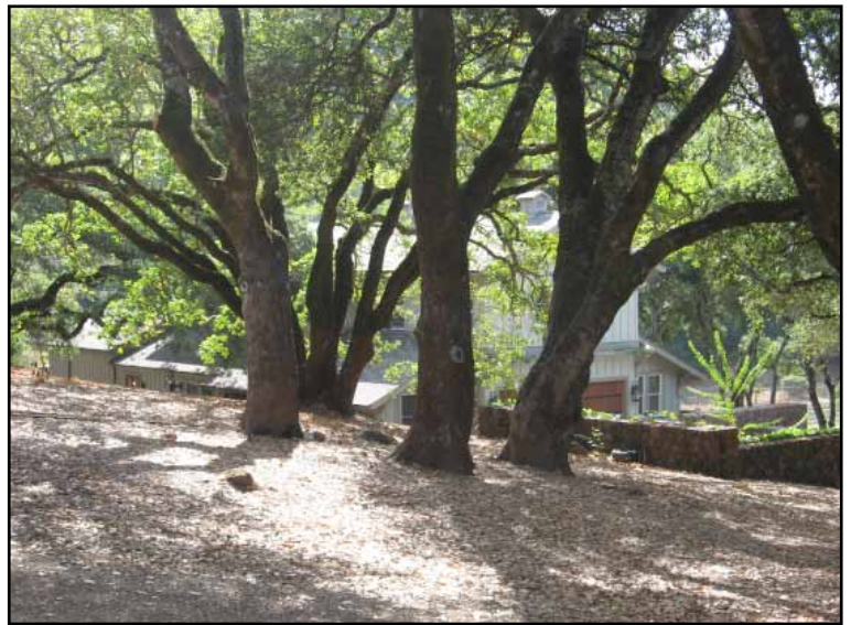
Defensible space need NOT be a moonscape. Thoughtful landscaping can be beautiful and safe.

Creating an effective defensible space means developing a series of management zones in which you do greater or lesser fuel modifications. Develop defensible space around each building on your property. Include detached garages, storage buildings, well houses, barns, and other structures in your plan.