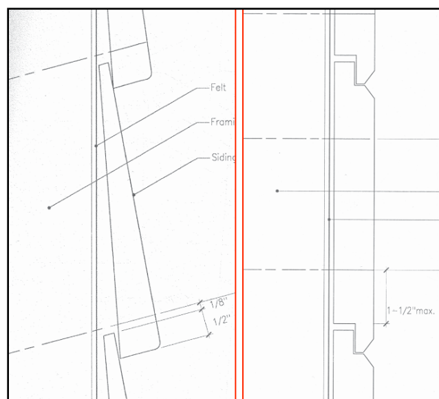
Plain bevel lap joint

If you have an ignition-prone siding like wood shake, but can't afford to replace it, you may want to consider investing in a gel fire retardant. Gels hold water in suspension on the walls, decreasing likelihood that an ember will cause the siding to burn. These products are applied to the structure when a fire threatens, preferably no more than four hours before the flame front hits—something that may be impossible if the fire is moving very fast and residents need to evacuate immediately. Several products are currently available on the market. Do some research and talk with your local CAL FIRE or Fire Department representative, both with questions about the products and to let them know that it is available on your property.