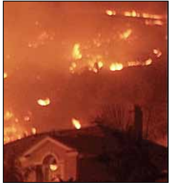
Embers and firebrands are the biggest threat to homes.

Defensible space is crucial for three reasons: to save lives of residents and firefighters, to keep fires that start in structures from escaping into the wildland, and to prevent home loss in a wildfire. Reducing vegetation helps protect structures by ensuring that intense radiant heat is far enough away from the sides of the building that the heat doesn't ignite the structure. Defensible space also ensures that flammable brush does not act as kindling allowing direct transmission of flames to the structure. "Defensible space" does not mean "moonscape." A good defensible space is likely to have lots of trees, but low branches and brush has been modified to remove the "ladder fuels" that increase fire behavior. Your defensible space landscape should be even more beautiful and wildlife friendly than before treatment. But there is much more to the picture than vegetation.