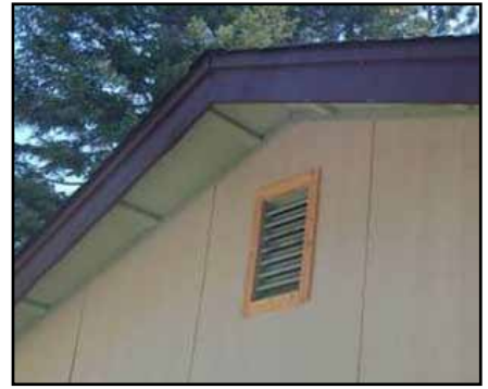
Gable end vent