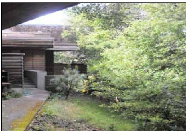
Defensible space: before ...