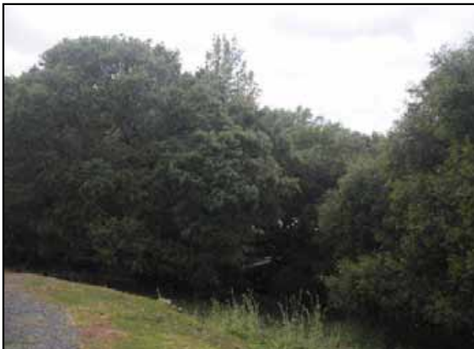
Defensible space: before...

The Sonoma County Fire and Emergency Services Department currently has a seasonal free curbside chipper program for residents in some areas at risk to wildfire. The program sends a chipper and crew to chip woody materials that have been cut and stacked by residents. You can find out about the program at www.sonomacounty.ca.gov/FES/Fire-Prevention/Curbside-Chipper-Program or by calling 707-565-6070.